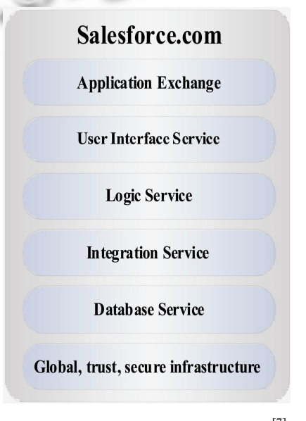
Fig.1 A complete CRM solution<sup>[7]</sup>

As is implicit in the above definition, the purpose of CRM is to improve marketing productivity. According to the official site of Salesforce.com, a complete CRM solution is presented below. Fig.1 depicts the important components of a CRM solution.